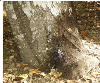
Phytophthora ramorum canker at the base of a coast live oak.

Annual spraying with Agri-fos helps immunize oaks from SOD. Contract a tree spraying company to spray your most beloved oak trees during the cold winter months. Removing bay laurels that are touching or under your oaks is also a defense.